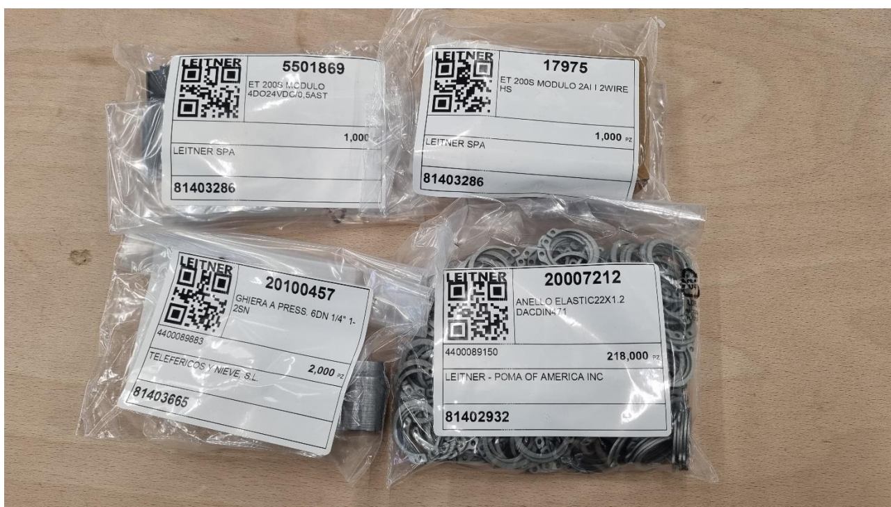
Fig.1 Examples of product label on articles

we are pleased to inform you of a new product label. In order to make the deliveries more efficient and to make it easier to find the material once it arrives on site, we have introduced a new label that will be present on every item ordered (Fig. 1).